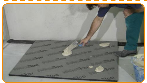
Apply the glue on the panel by spreading it Apply the panel on the wall by forcing with on dots.