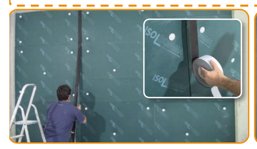
When all panels are fixed seal the panel joints with the "Stik" tape.