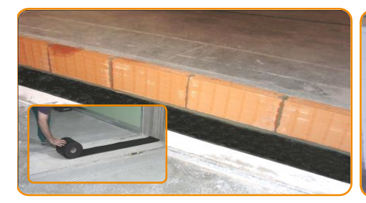
Lay the under wall strip in the dry floor before to build the wall.