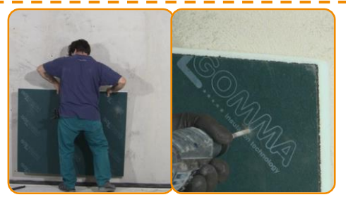
Place the panel on the right wall position and produce 5 holes per panel with the driller (one in the centre and one in the four corners)