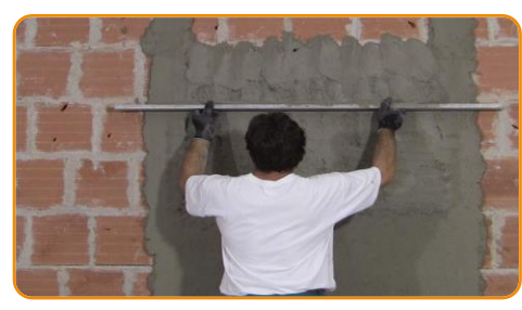
of about 1 cm thickness