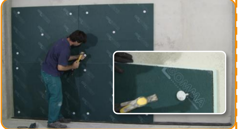
Apply the five plastic nails with the hammer.