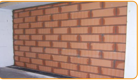
Build up the wall by caring to joint the blocks Apply in the first wall a layer of row mortar with mortar on both vertical and horizontal ioints.