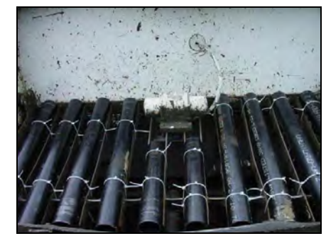
Temporary metal pipe lay-over method zip-tied in place