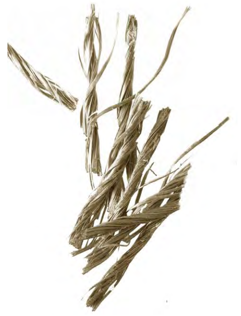
FORTA-FERRO® patented bundles

The correct time and place to add macro fibers to the concrete mixing system varies for different fibers, and therefore it becomes very important to determine the optimum process for the particular fiber being used on the project. Recommendations for one fiber may not apply to another, and therefore the correct addition point and practice should not be assumed as normal, especially with the higher dosages typically required for slab on deck applications. To affect the capacity to hold potential cracks tightly together, it is especially critical to have uniform fiber distribution without clumping or balling. A reasonable litmus test to pre-determine a particular fiber's ability to mix without clumping is to inspect the fiber in its original package – it's safe to assume that if the fiber is tangled in the bag it comes in, it's not likely to un-tangle in 4,000 pounds of wet concrete! If the fibers do not gravity feed well when dry, then special addition tactics will be required, such as feathering them slowly into the mixing system which would require extra time and patience on the part of the ready-mix supplier.