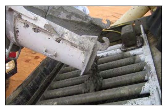
A permanent round-bar grate is essentially self-cleansing at high fiber dosages.

There are several grate-fix options available – some of which require only a few minutes to prepare – but all deserve forethought before the first ready-mix truck arrives at the pump hopper. The FORTA® Technical Report: "Pumping High-Volume Fibers" 5 provides extensive details regarding all aspects of pumping macro-synthetic fibers, such as chute location and height, critical grate and hopper vibration, and both permanent and temporary grate rehabs. Essentially, the grate change simply involves changing the shape of the slats – from thin and square to thick and round – to allow the high-fiber concrete to easily flow through rather than hang up or drape over. For whatever reason, the pump-grate fiber-flow issue is the most often ignored pre-construction warning, and the most time-consuming and costly when not addressed. Since the concrete on the vast majority of slab-on-deck projects is pumped into place, addressing these pump-grate issues is one of the most important fiber facets that should be included in high-fiber specifications and pre-construction project meetings.